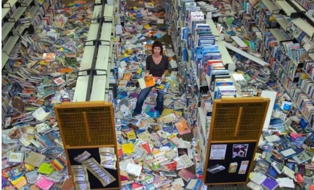
HB Williams Library (New Zeland) after 2007 earthquake